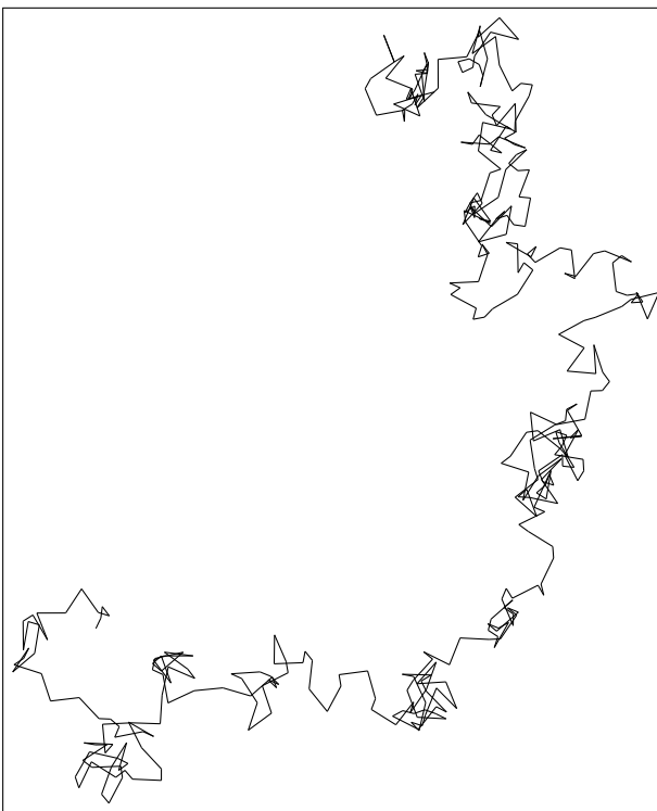
Figure 1: The result of RandomWalk{number = 400, length = {4pt, 10pt}} : a 400 steps long walk, where each step has one of two lengths.

The simplest is to give a list of all the keys, and their meaning: